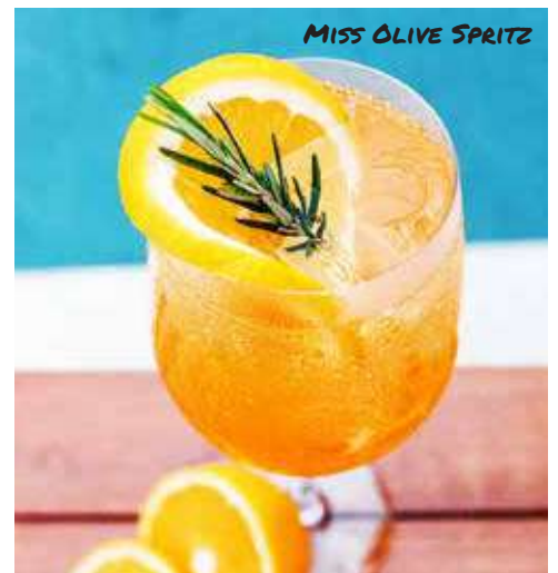
MISS OLIVE SPRITZ