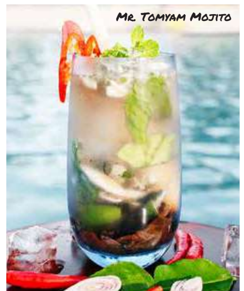
MR. TOMYAM MOJITO