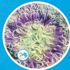
Corkscrew Tentacle Sea Anemone ( Macroactyla doreensis )