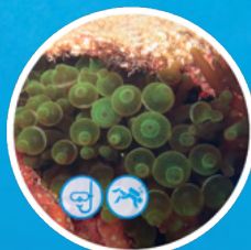
Bulb Tentacle Sea Anemone ( Entacmaea quadricolor )