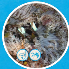
Beaded Sea Anemone ( Heteractis aurora )