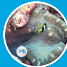
Adhesive Sea Anemone ( Cryptodendrum adhaesivum )