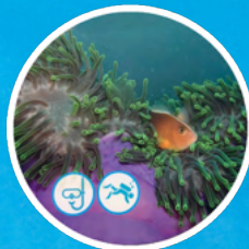
Magnificent Sea Anemone ( Heteractis magnifica )