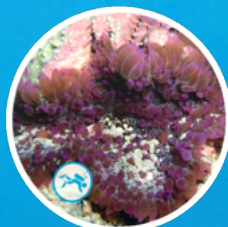
Delicate Sea Anemone ( Heteractis malu )