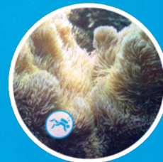
Gigantic Sea Anemone ( Stichodactyla gigantea )