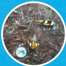
Leathery Sea Anemone ( Heteractis crispa )