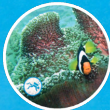
Merten's Sea Anemone ( Stichodactyla mertensii )